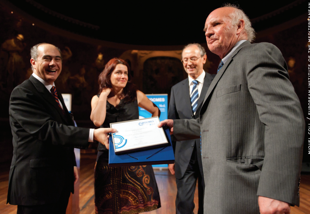
MIQUEL COLL / EUROPEAN INSTITUTE OF THE MEDITERRANEAN