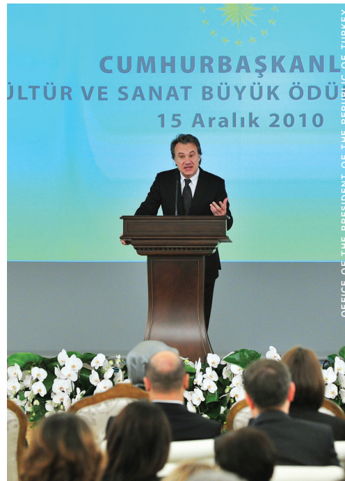
OFFICE OF THE PRESIDENT OF THE REPUBLIC OF TURKEY