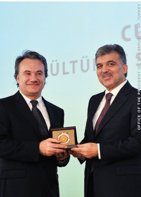
OFFICE OF THE PRESIDENT OF THE REPUBLIC OF TURKEY