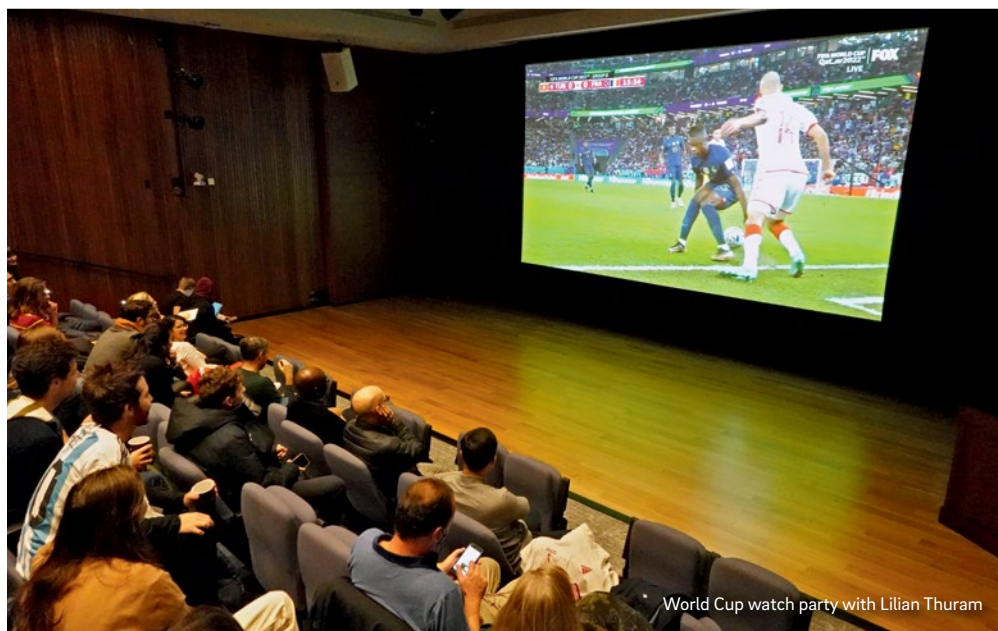
World Cup watch party with Lilian Thuram

White Thinking: Behind the Mask of Racial Identity. A book talk with Lilian Thuram, French author and former professional footballer. Co-sponsored with the Weatherhead Center for International Affairs, Weatherhead Initiative on Global History, and the Department of Sociology.