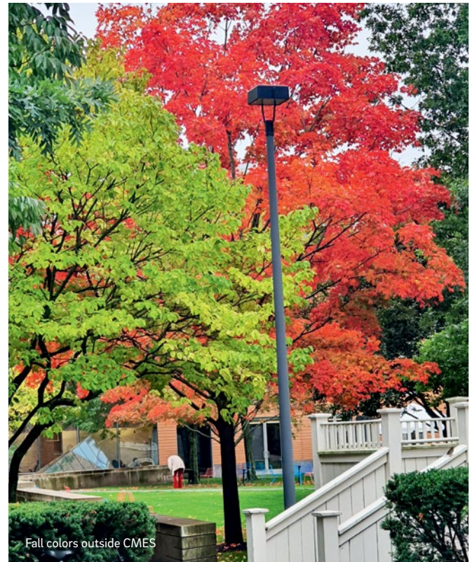
Fall colors outside CMES

days were so long, compared to my hectic schedule and busy-bee life in Tunisia. The seminars and workshops I attended introduced me to an agreeable level of academic expertise and research skills that were, and I am quite proud of saying it, equivalent to the level that exists in my country. I loved my country even more, I felt thankful and grateful for the versatile academic training I received there and felt determined, more than ever, to honor all that by working harder. I made friends with