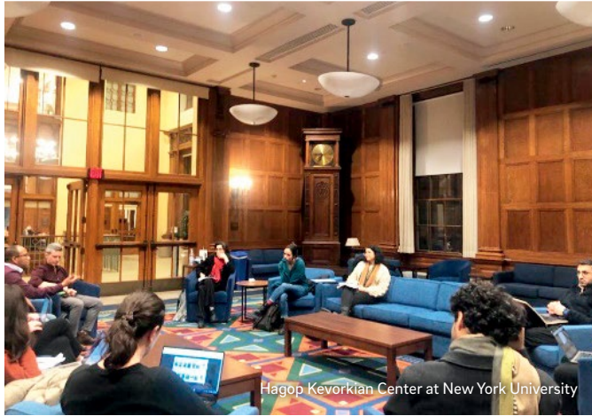
Hagop Kevorkian Center at New York University