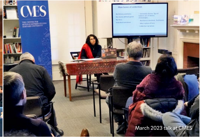
March 2023 talk at CMES

I was also invited to deliver a talk on the value of Arabic language in the world of interpreting and had the chance to present my research in another talk at CMES in March.