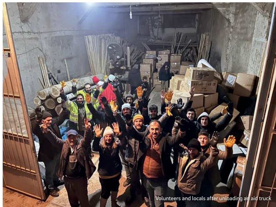
Volunteers and locals after unloading an aid truck

containers. However, these were not being provided except for in a few areas in the town center.