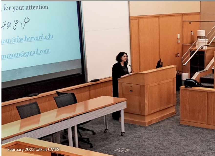
February 2023 talk at CMES