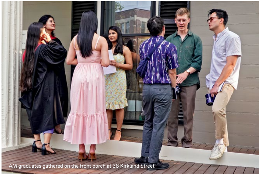
AM graduates gathered on the front porch at 38 Kirkland Street